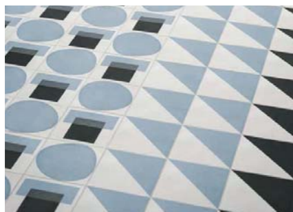
Trend 01 // Pattern Power

C.P.Hart travelled to Cersaie in Bologna and London's Decorex International to track down the key trends at these hugely influential design exhibitions. The themes displayed by both established brands and up-and-coming makers give us a clear idea of what we can expect to see in the coming year when it comes to wall and floor coverings, sanitaryware, furniture and accessories. Read on for a summary of these trends, along with a selection of products you can incorporate into your home.