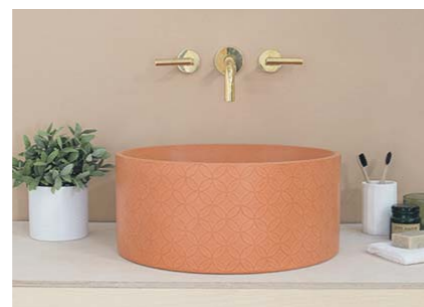
Trend 02 // Bold Neutrals