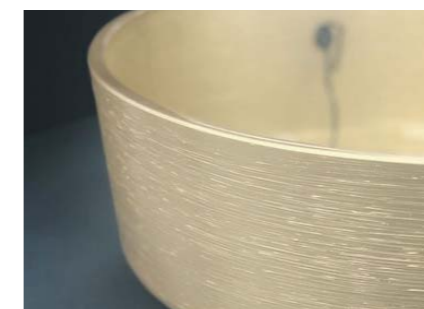
Trend 04 // Satin Sheen