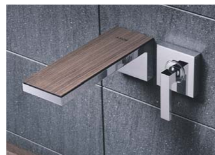
Trend 03 // The Natural Home